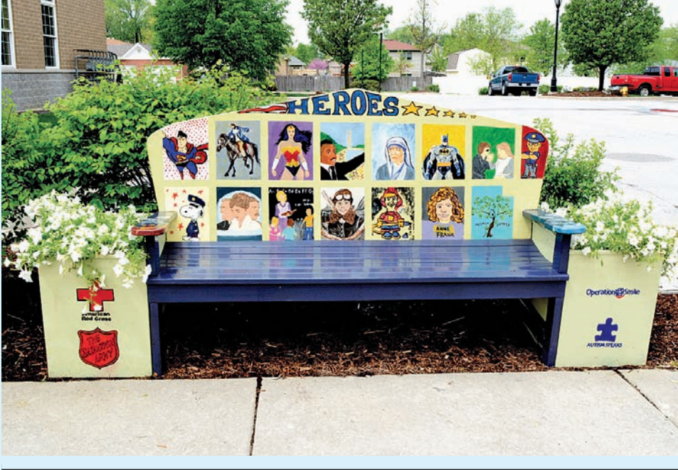
7 All Our Heroes Artist: Garden Gallery Artists & the public Sponsor: Robinson Engineering Ltd. & Klein, Thorpe & Jenkins Ltd. 17208 S. Oak Park Avenue

The six District 146 art teachers who combined their talents to create this bench used acrylic paint and plywood to depict sports heroes from each of the five Chicago teams – Paul Konerko of the Chicago White Sox, Joakim Noah from the Chicago Bulls, Jonathan Toews of the Chicago Blackhawks, Walter Payton of the Chicago Bears, and Anthony Rizzo from the Chicago Cubs. The back and sides feature a wrap-around silhouette of the city with the "L". This group of first-year bench artists was excited to collaborate on a project for the community and their students to enjoy.