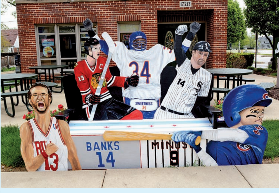
6 Chicago Sports Heroes Artist: District 146 Art Teachers Sponsor: Durkin Electric 17217 S. Oak Park Avenue