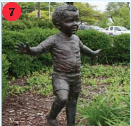
Heading Out sculpted by Dennis Smith. Heading Out is an image about beginnings. Think about the mind and vision of a child; the trial and error—the pure work that accompanies the task of learning to walk. Beyond the falls, the bumps and bruises of the effort, finally those first steps take form, and the child heads out into the wide and endless vision of a world filled with new things and endless places to explore.