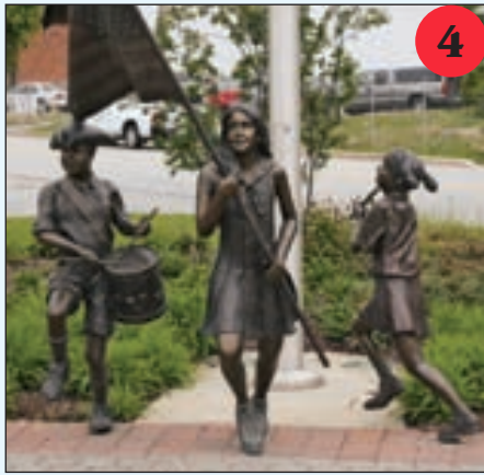
4 Long May It Wave sculpted by Blair Muhlestein. Three children, recreating the battle weary flag-bearer and fife and drum players of the Revolutionary War as they play. This sculpture takes on added significance as we remember the events of September 11, 2001. We continue to take pride in our flag and what it symbolizes and remember to rejoice in our freedoms as Americans. We also are reminded that the freedoms we enjoy came about because of the sacrifices of many and that it takes continued vigilance to stamp out hatred, fostering understanding and respect for all the peoples of this world.