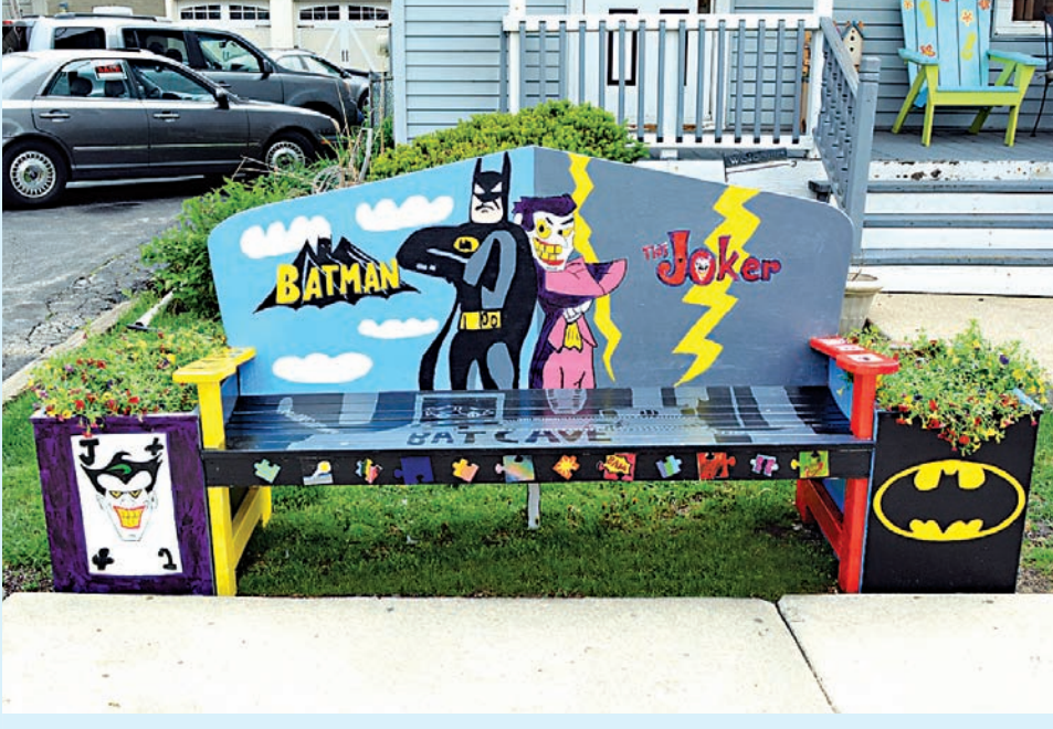
4 When Heroes' and Villains' Worlds Collide Artist: Students of Easter Seals Therapeutic Autism School in Tinley Park Sponsor: Odyssey Fun Farm 17255 S. Oak Park Avenue